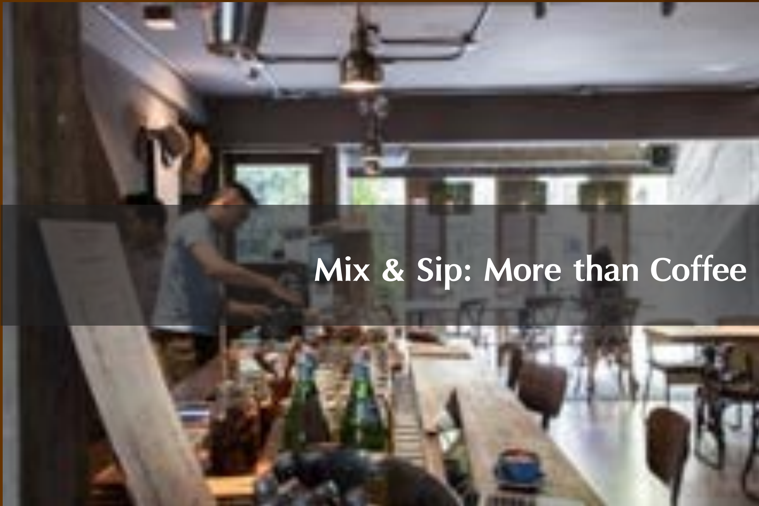
Mix & Sip: More than Coffee