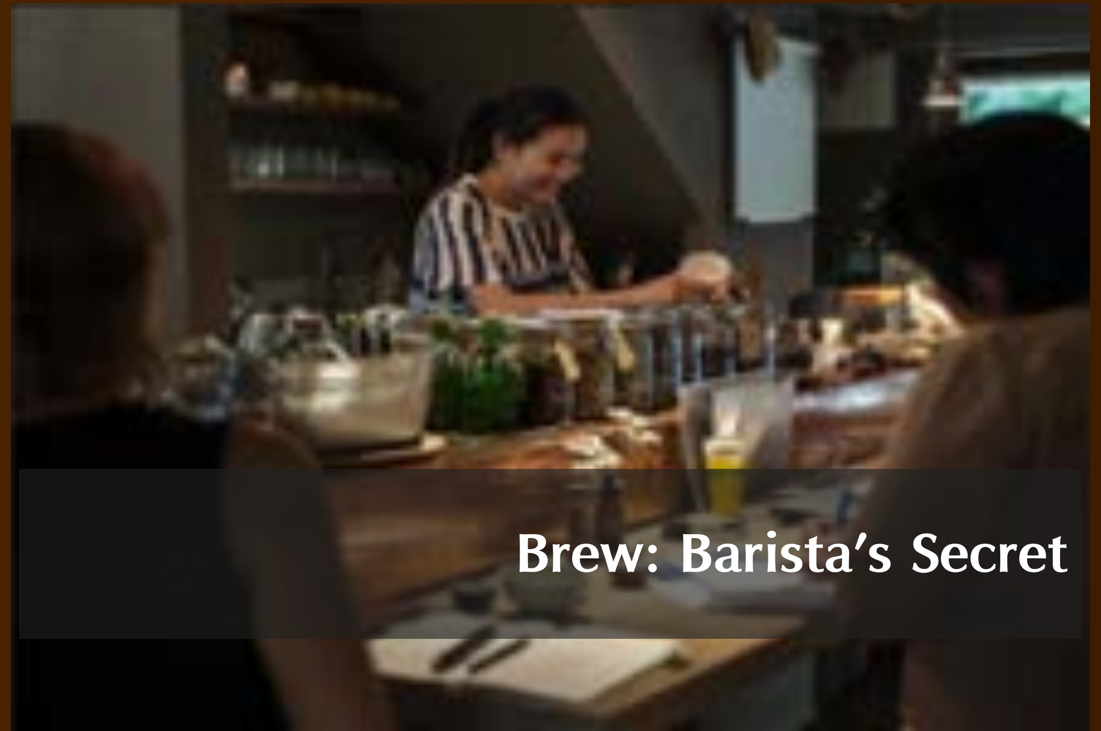
Brew: Barista's Secret