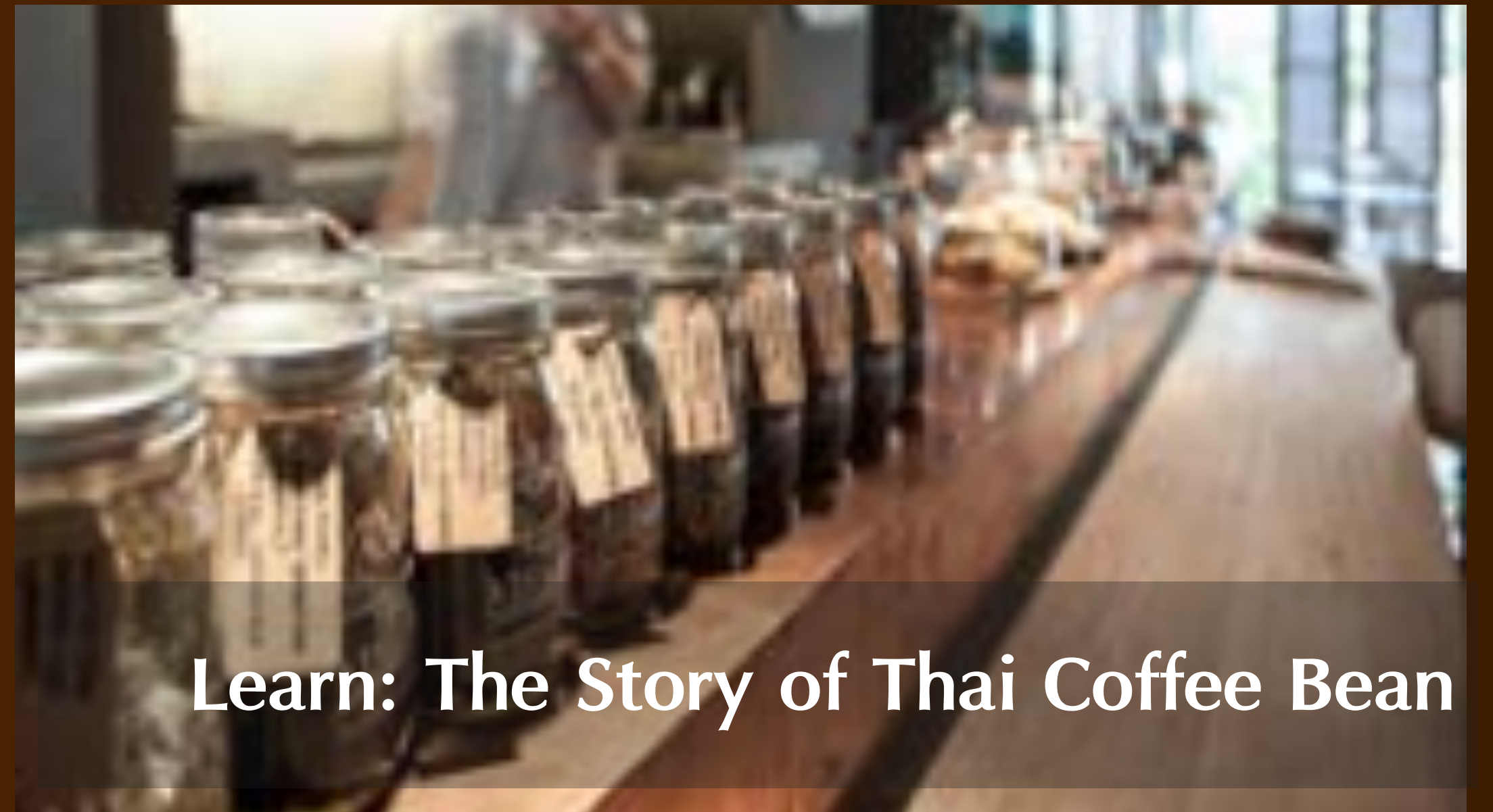
Learn: The Story of Thai Coffee Bean